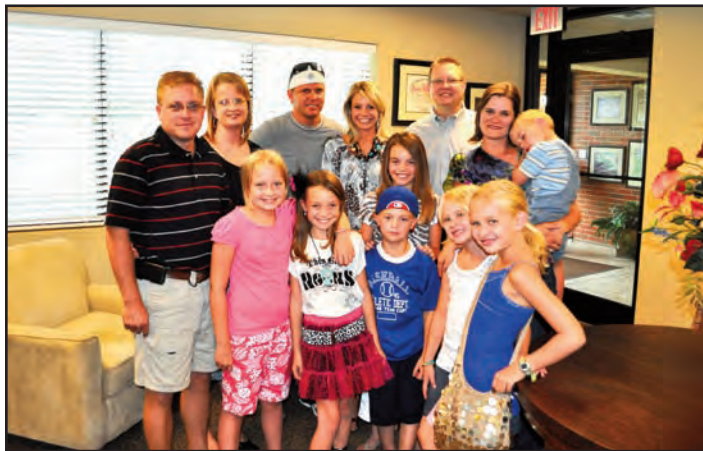
A group from Vintage Township hosted a water fun day in their neighborhood and donated the proceeds to the children at the Home.

The Children's Home of Lubbock was recognized as the outstanding non-profit advocate for abused children in the South Plains area at a luncheon hosted by Children's Advocacy Center of the South Plains.