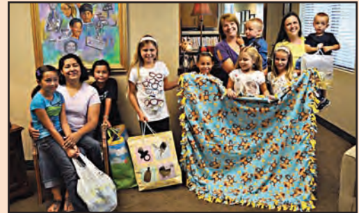
The 1st and 2nd grade classes at South Plains Church of Christ made blankets for the babies at the Home and delivered them to the campus.